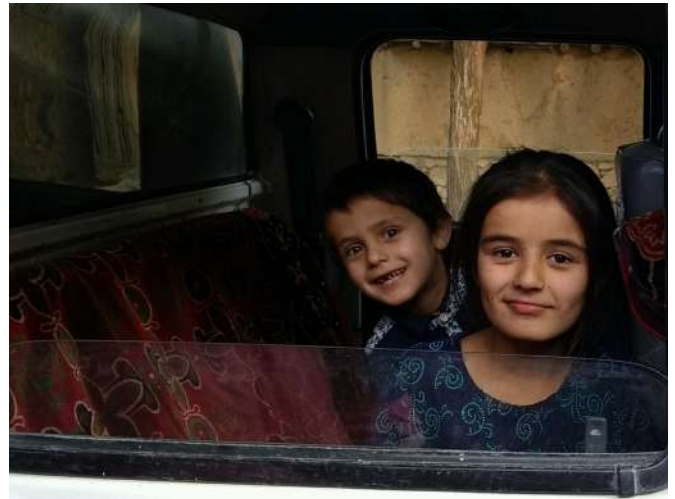
A young boy and girl in Afghanistan.

When analyzing the top 10 Pressure Points for 2021, three words synthesize the characteristic challenges