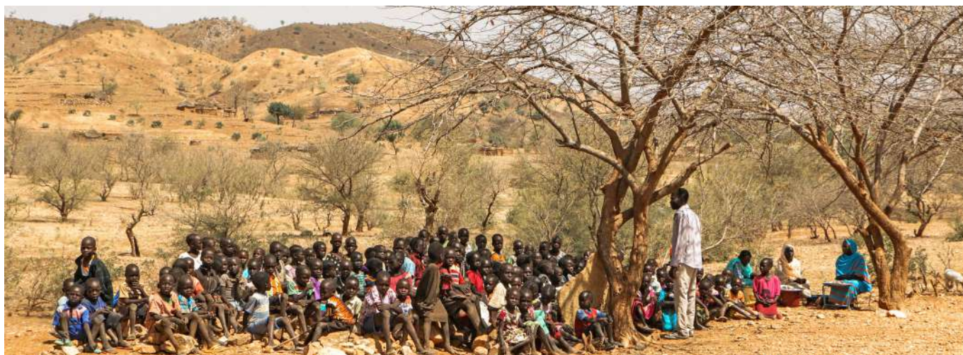
A class of students in Sudan.

a parent's Christian conversion, courts may automatically take away custody of children based solely on a parent's faith. Alternatively, extended families remove children from Christian parents, a practice accepted by communities due to embedded social norms. States can exert further power over Christian parents: similar to the administration challenges churches face in the region, Christian parents with an Islamic background can often struggle to register children. 21 Chart 1 shows this in the high percentages for Denied access to a Christian parent and Denied legal identity as a Christian.