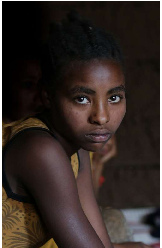
Eldest daughter of widowed and destitute Christian mother, southern Ethiopia.

Government armies, militias and criminal groups exploit Christian children and youth in conflict zones as commodities. They are shaped into child soldiers ( see page 10: Gender and CSRP-YSRP ), or bought and sold as products trafficked for