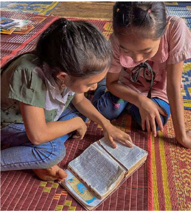
Girls reading the Bible in Laos.

Asia Asia records median percentages for the top Pressure Points as seen in Chart 1. Yet distinctively, the political dominance of majority religions creates opportunities to target young people. For example, Christian children are denied accurate religious legal identities due to automatic registering of newborns as the majority or presumed religion. Christian parents may not legally have the option to register children as Christian, with children experiencing consequences of misassigned legal identities throughout their lives. This is not specific to one religion; an expert in Myanmar comments “Christians are automatically depicted as Buddhist in Bama dominated regions. All Muslim background believers (MBBs) are registered as Muslims, so the children also are automatically registered as Muslim.” Whereas in India, children of Christian parents are frequently registered as Hindu, especially if given non-anglicized names. In Malaysia, there have been several court cases where parents have divorced, with the parent who converted to Islam being granted custody and the children thus being registered as Muslim.