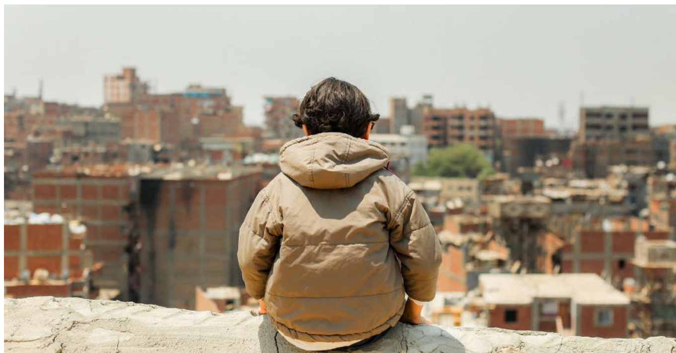
A young Egyptian boy watching over his city.

Recognizing the end goals of CSRP-YSRP and the risks can encourage LFAs and policy makers to work together to ensure the broadest space of religious freedom for children and youth as they grow into their own unique spirituality. Policy makers can ensure that the intersection of children's rights with religious faith (or belonging to a family with religious faith) is recognized as an additional vulnerability. Together, adults committed to religious freedom can work to preserve the opportunity for children and youth to learn and grow in the faith of their parents and the child's right to and developing capacity to explore freedom of religion or belief.