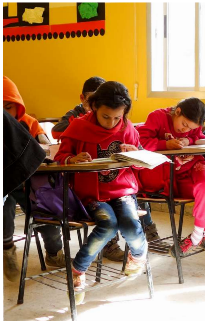
Class with Syrian children.

Four of the associated Pressure Points comprise different forms of violence (verbal, sexual, physical, and psychological) in addition to the discrimination inherent in Denied access to social community/ networks (children and youth shunned by classmates). Education has the power and potential to create cultures of tolerance and understanding, but equally, can “fuel stereotyping, animosity” and “entrench disadvantage”. 30 Carried out primarily by peers and teachers, an enabling environment often ignores, or worse, actively encourages such activities. Harassment of Christians may be seen as legitimate or even unremarkable, and so, these Pressure Points can be carried out with relative impunity.