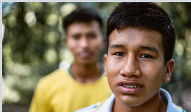
Young boys from the Nasa-Páez indigenous community in Colombia.

When a child's path for education is restricted, it statistically leads to reduced socio-economic status. 49 As noted above in Spotlight: Education (see page 8), such restricted paths often lead to other vulnerabilities such as child marriage, trafficking and physical violence.