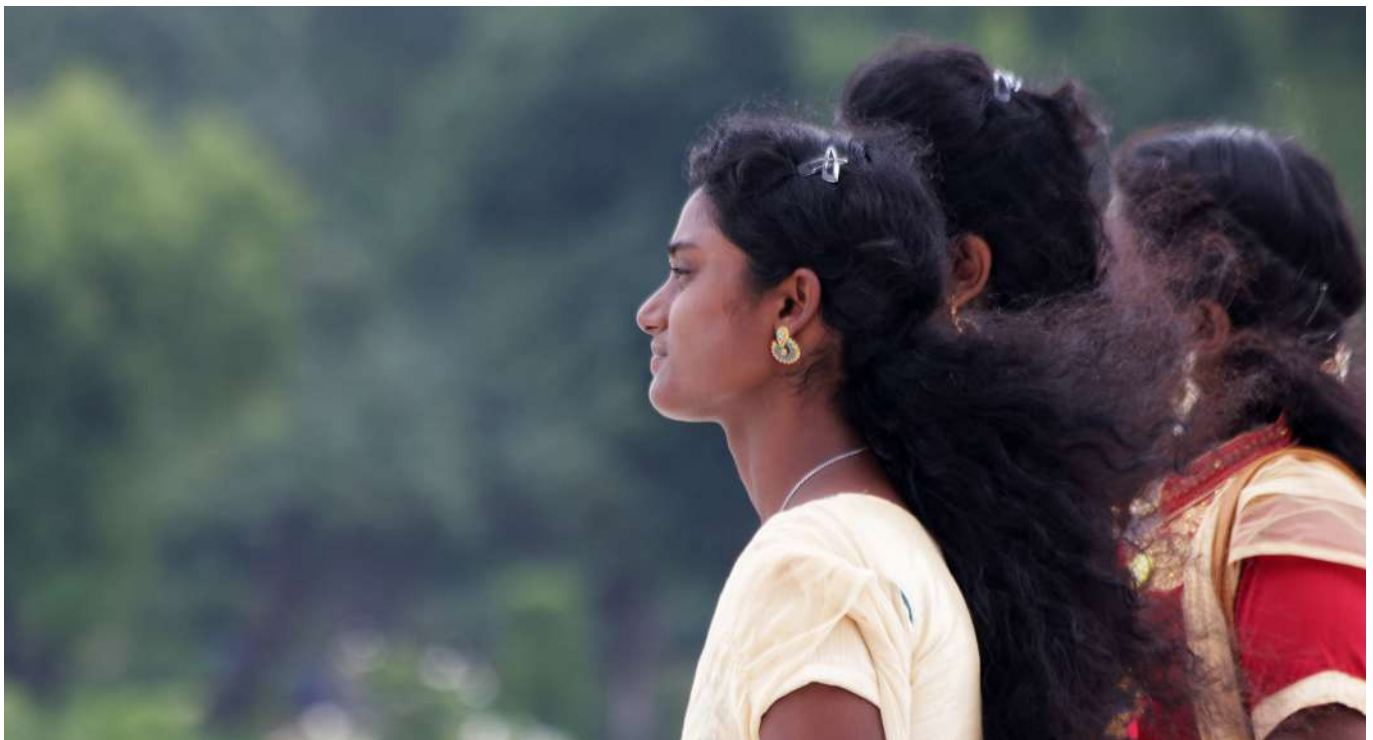
Teenage girls in Northern India.

As seen in Chart 2, Forced marriage and Violence - sexual were the two most widely reported Pressure Points for girls across the WWL 2021 top 50 countries. Affiliated Pressure Points such as Abduction, Trafficking and Targeted seduction also contribute to a pattern of targeting girls for their sexual purity and marriageability. Girls are usually fully dependent on family for financial and physical security and thus highly vulnerable should persecution come from within their family unit; escape is rarely an option.