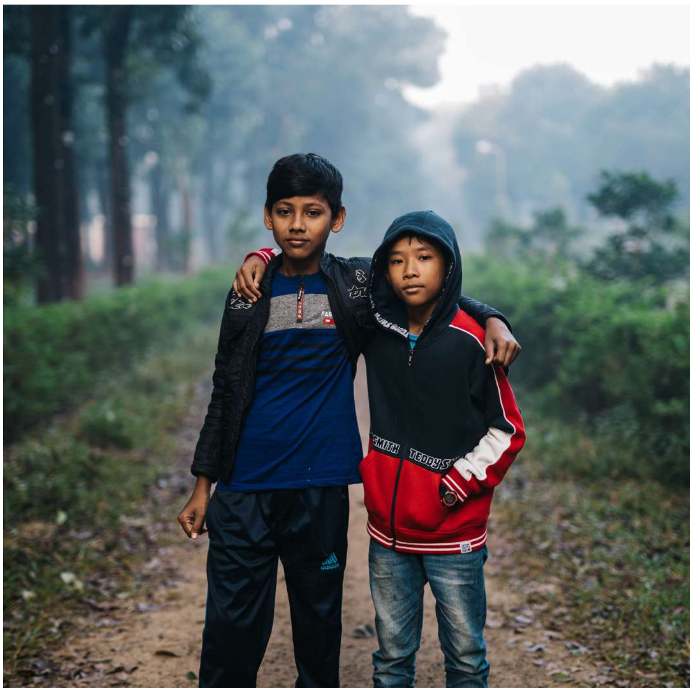
Christian boys of Muslim background in Bangladesh.

in many countries where Christians are persecuted, with persecuting actors ranging from family members to peers to violent groups. Generally, this is motivated by those of majority religions or ideologies aiming to pressurize conversion, either to put pressure on relations, or using violence as a response to the rejection of the majority religion or belief. Yet sometimes there are specific triggers for violence, as in parts of Syria and Egypt, where witnesses reported that perceived immorality in the way Christian girls dress results in physical abuse. More commonly, the trigger is the refusal to renounce their faith or participate in the activities of violent groups.